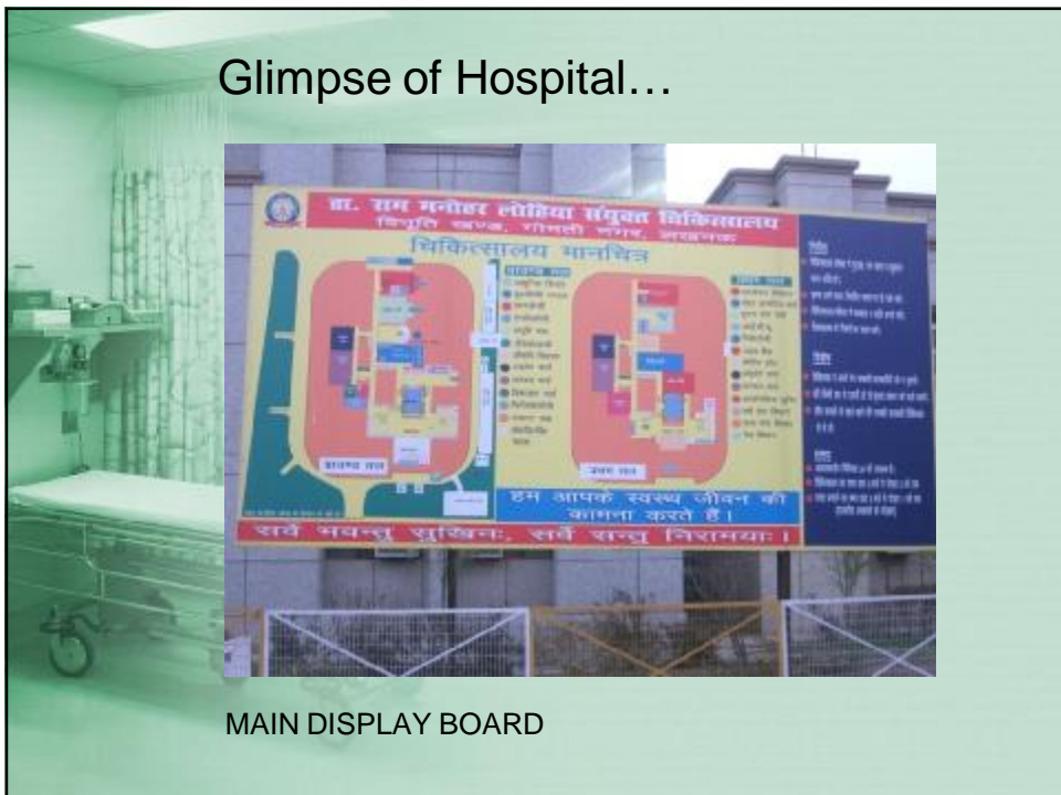
MAIN DISPLAY BOARD