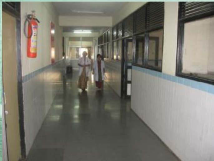
OBS. & GYNAE. WARD