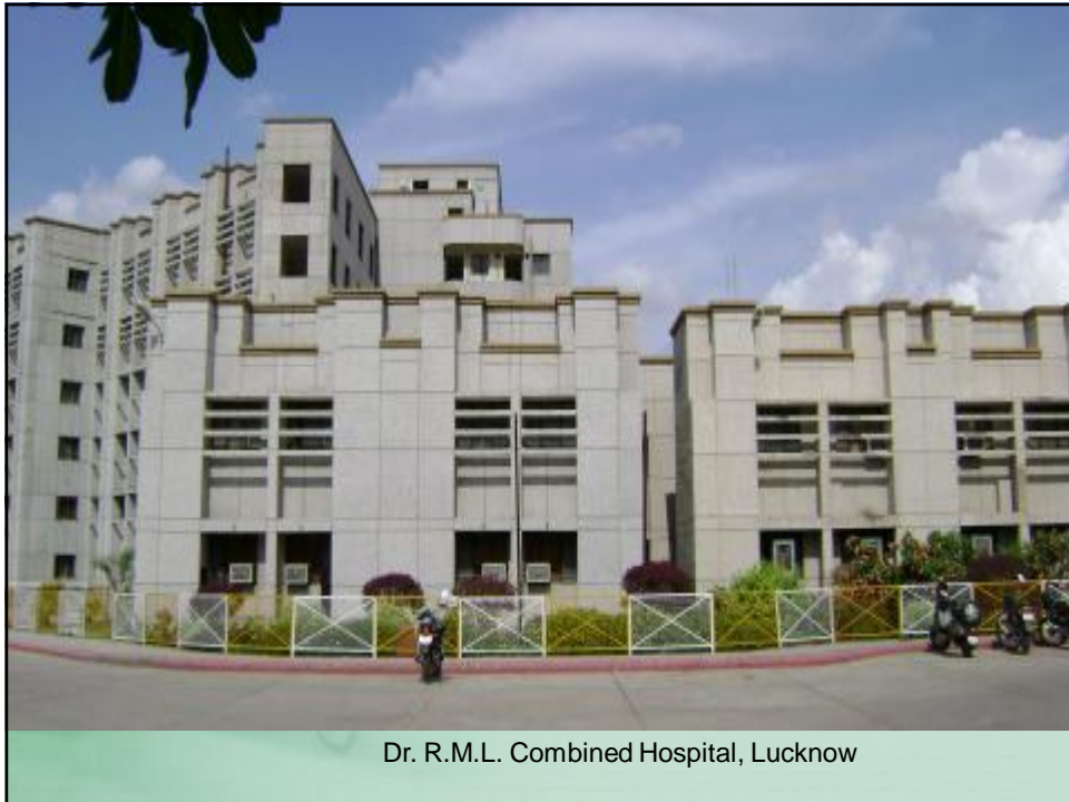
Dr. R.M.L. Combined Hospital, Lucknow